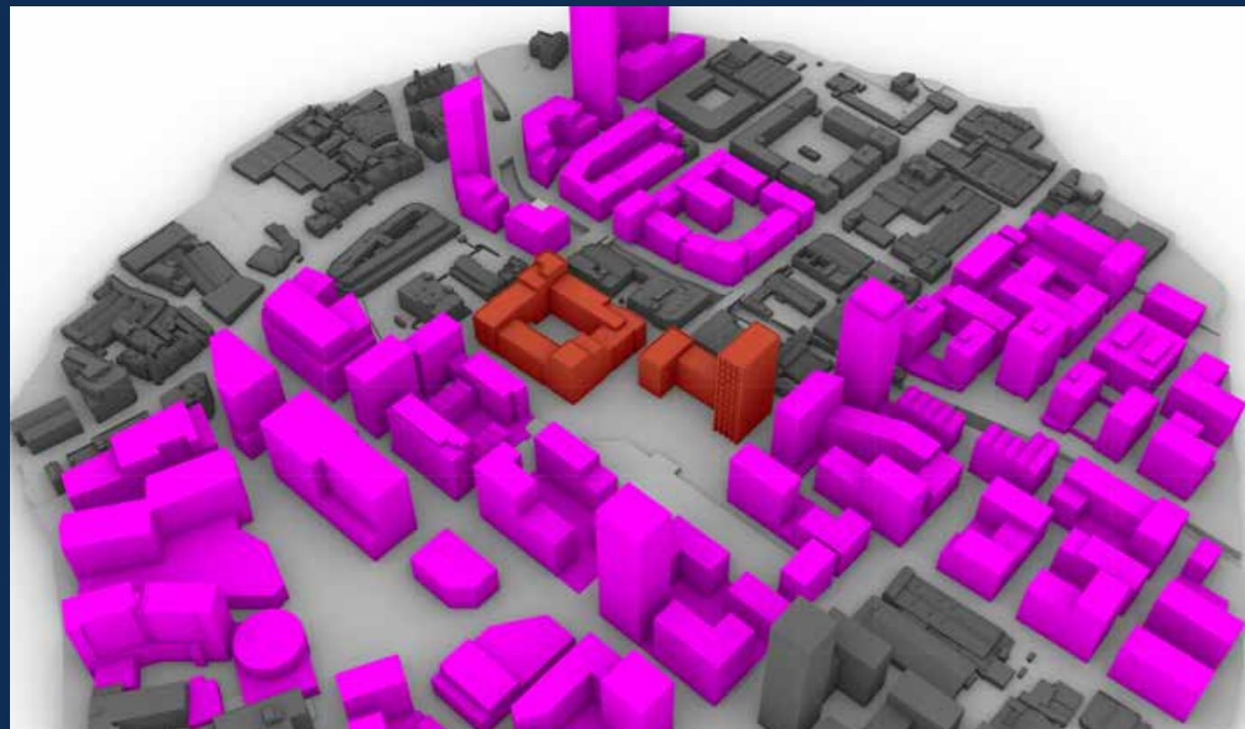
B) Currently consented, pending planning and pre constructed developments within the Smithfield area