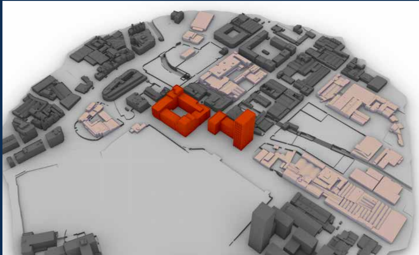
A) Current existing building + Smithfield lofts